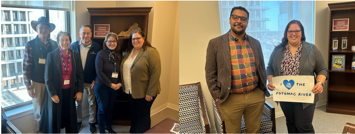
Virginia Interfaith Center