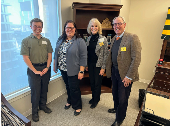
Virginians Organized for Interfaith Community Engagement (VOICE)