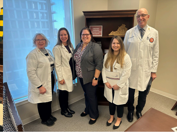
The Medical Society of Virginia

This week, our office met with constituents and several organizations including the Virginians Organized for Interfaith Community Engagement (VOICE), the Virginia Interfaith Center, SAARA of VA, the Medical Society of Virginia, the Virginia Dental Association, and Potomac Conservancy. These organizations advocated for numerous solutions that addresses many issues including healthcare accessibility, housing needs, and environmental protections.