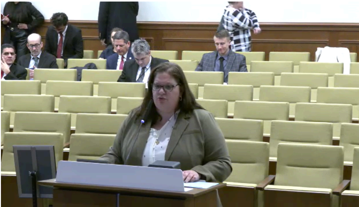
January 15, 2025 - General Laws and Technology - SR B (306) - 30...

SB 1210, unanimously passed out of committee this week. Some of the new neighborhoods located in the 36th District are located very close to Dulles International Airport. As Dulles Airport continues to expand operations, the bill will help prospective homebuyers in Loudoun and Fairfax Counties set expectations and understand that there will likely be an increase in aircraft noise occurring in established noise overlay zones.