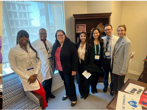
Virginia Dental Association