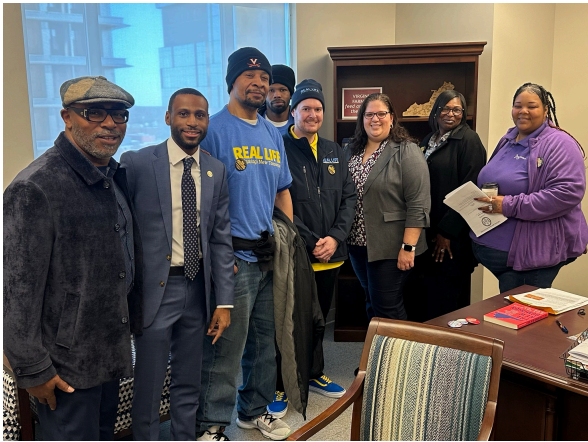
SAARA of VA

This week, our office met with constituents and several organizations including the Virginians Organized for Interfaith Community Engagement (VOICE), the Virginia Interfaith Center, SAARA of VA, the Medical Society of Virginia, the Virginia Dental Association, and Potomac Conservancy. These organizations advocated for numerous solutions that addresses many issues including healthcare accessibility, housing needs, and environmental protections.