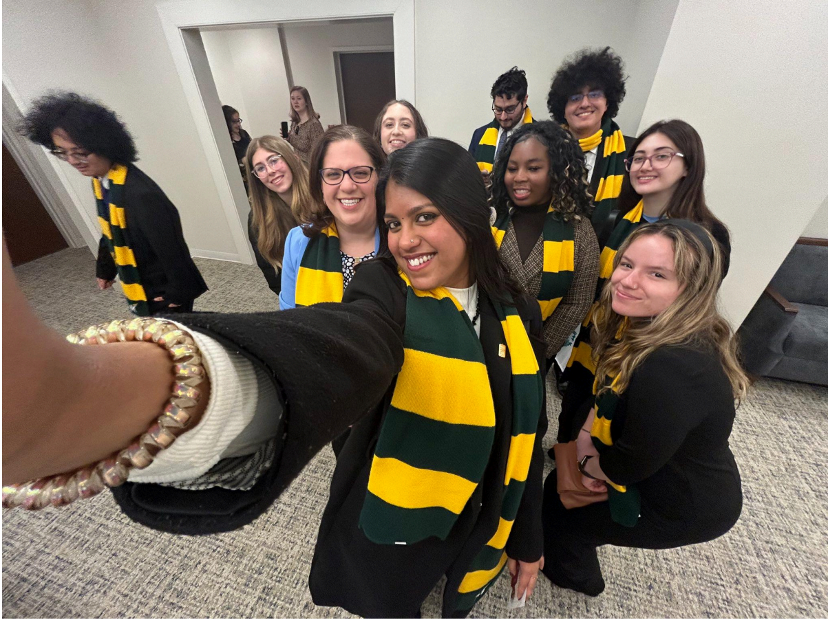
I met with students from my alma mater George Mason University.