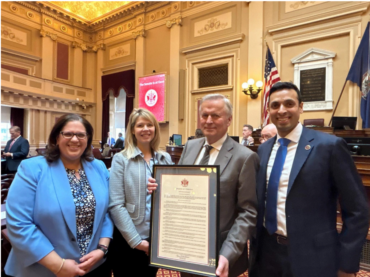
The Senate of Virginia honored author John Grisham.

This week was crossover! Eight of my bills passed the Senate of Virginia and are now in the House of Delegates.