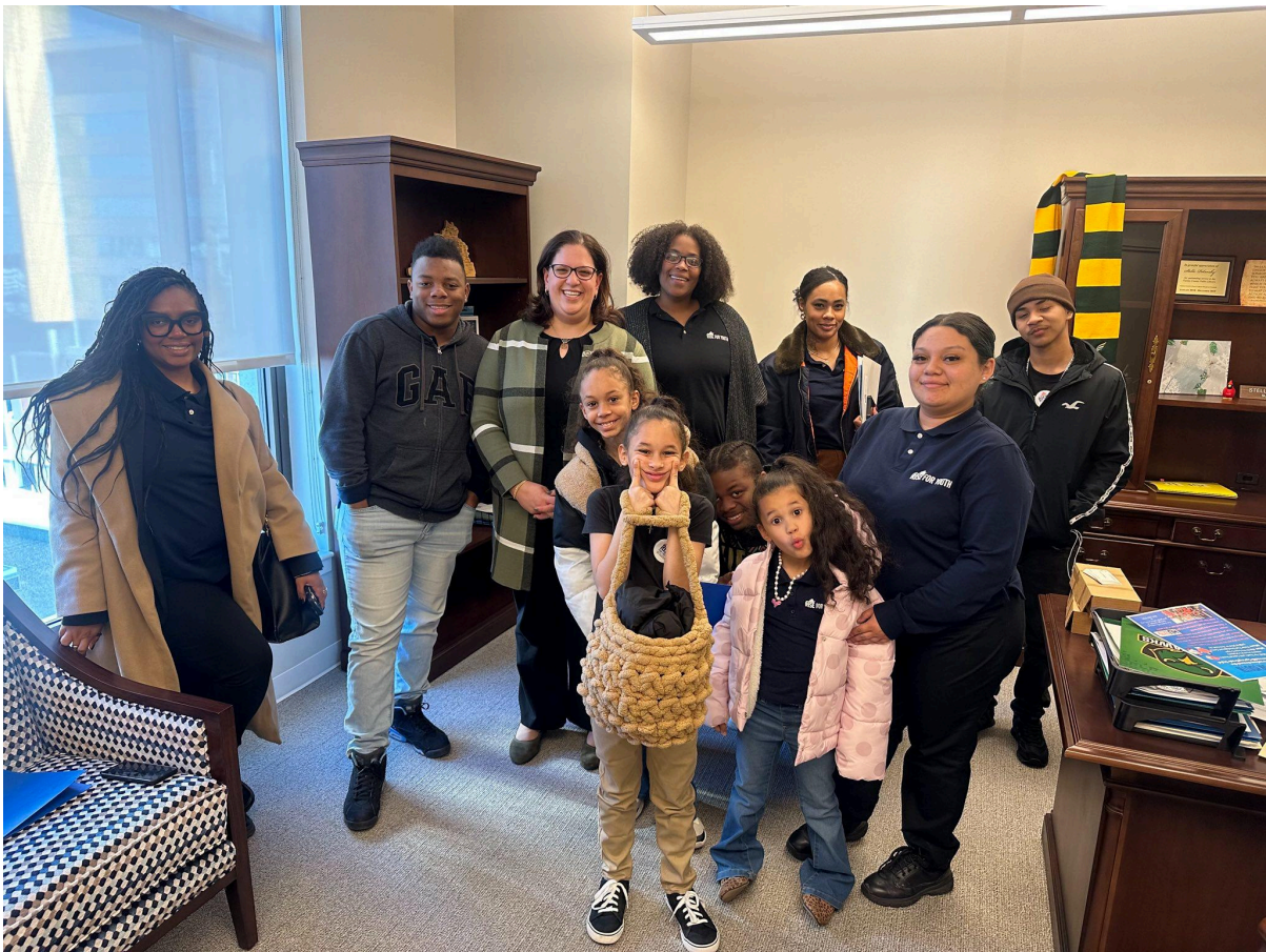
I met with Rise for Youth, an organization that promotes community-based alternatives to youth incarceration and the sustainment of healthy communities.