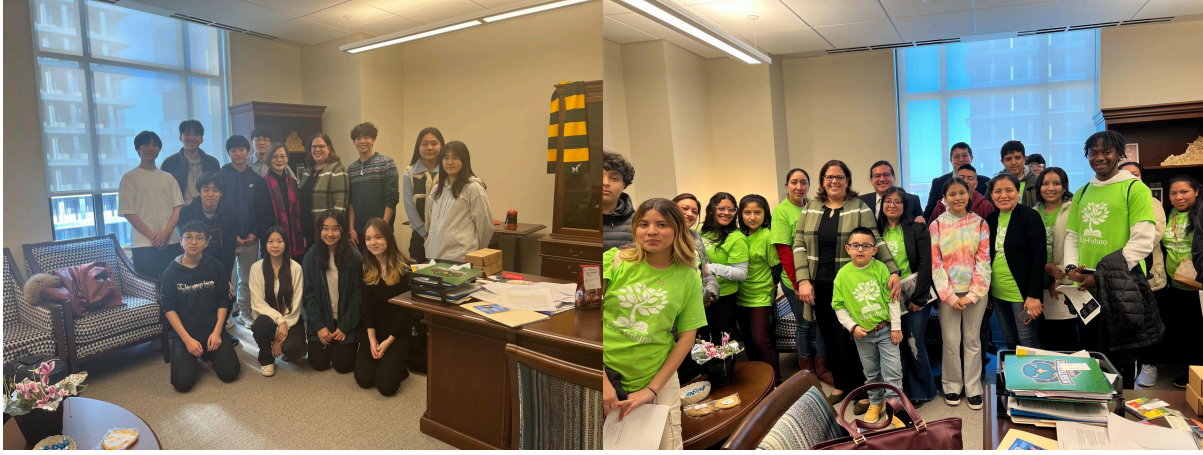
I met with the Korean-American NextGen Council and Edu-Futuro to talk about their legislative priorities.