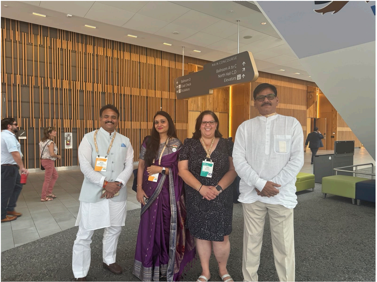
Meeting the delegation from India at the NCSL Summit.